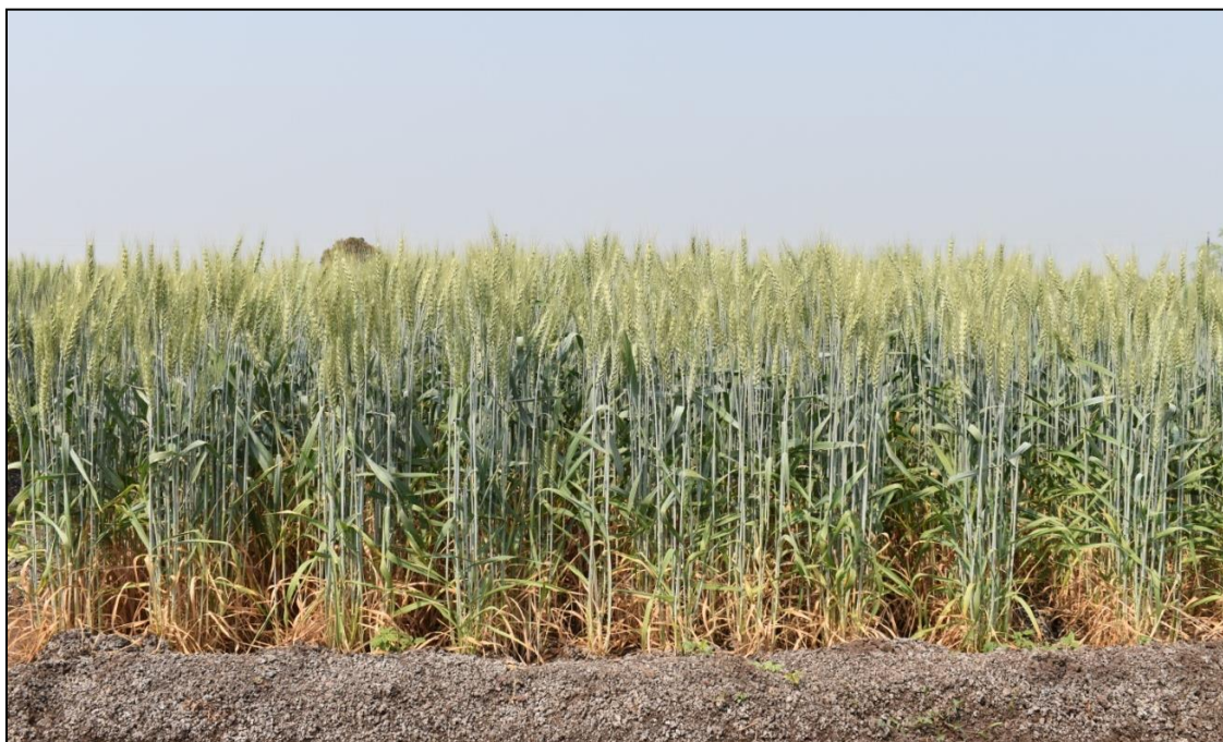
Field View of bread wheat variety Phule Anurag (NIAW 4028)

Wheat is one of the most important cereal crops cultivated in Maharashtra and Karnataka, playing a vital role in ensuring food security and supporting rural livelihoods. In Maharashtra, wheat is primarily grown during the rabi season under irrigated conditions as well as restricted irrigation conditions, with regions like Pune, Solapur, and Ahmednagar being key production areas. Similarly, in Karnataka, districts such as Vijayapura, Dharwad, and Gadag contribute significantly to wheat cultivation. The crop thrives in the moderate winter climate of these states, with adequate irrigation being a crucial factor for achieving good yields. Research and introduction of improved varieties have further enhanced wheat production in these regions, offering better disease resistance, adaptability, and higher yields to meet the growing demand for quality grains.