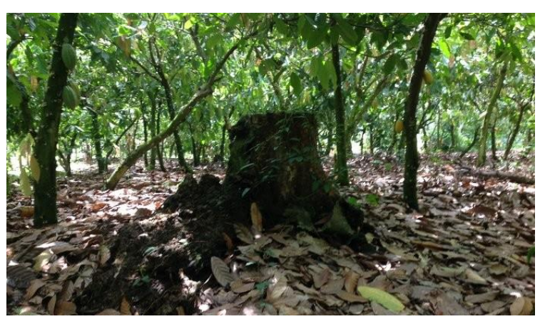
Figure 1. Carbon Sequestration in Cocoa Agroforestry

Five cocoa plants are to be planted between four oil palms. Holds about 400 plants per hectare.