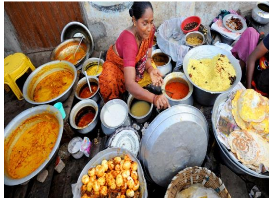
Street food sold