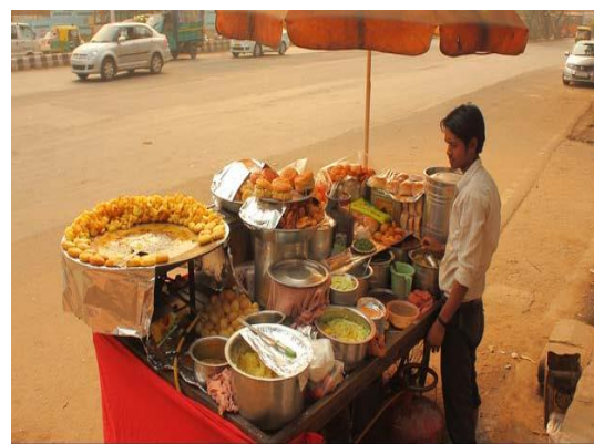
Street food vendors