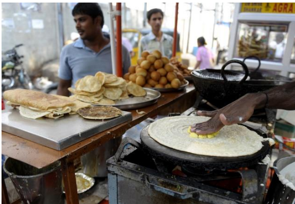
Street food preparation