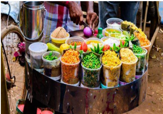
Street food selling under open place

Fast growing life style changes happens due to developing economic crisis. The urbanization and longer distances to work places from home makes it impossible to carry foods therefore they are purchased street foods as their daily nourishment. It tends to eat more for less spending. Due to the long hours working period of urban family under both are working have no time or energy to cook for their daily needs. Purchase of street foods boosting people to buy the way of proximity and easy accessibility to a variety of dishes along with convenience of home delivery. A vast number of